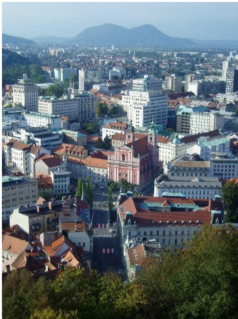
The central skyline of Ljubljana

Slovenia has 2 million citizens, but currently, there is no New Testament church. Our mission is to take the pure, unadulterated gospel to this country and to its people. Our aim is to plant a church in its capital city of Ljubljana and to grow out from there.