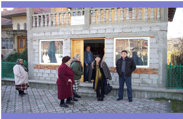
Our rented meeting house