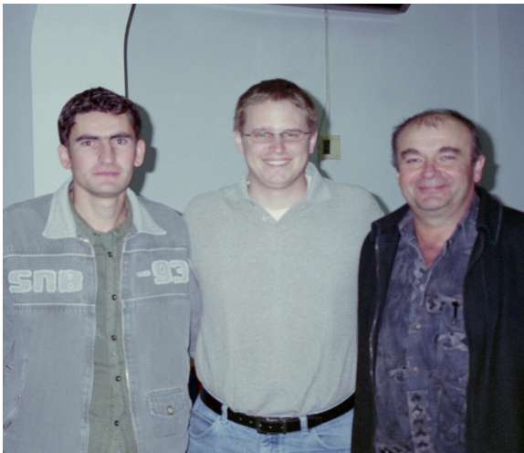
Studies with a father & son who posed